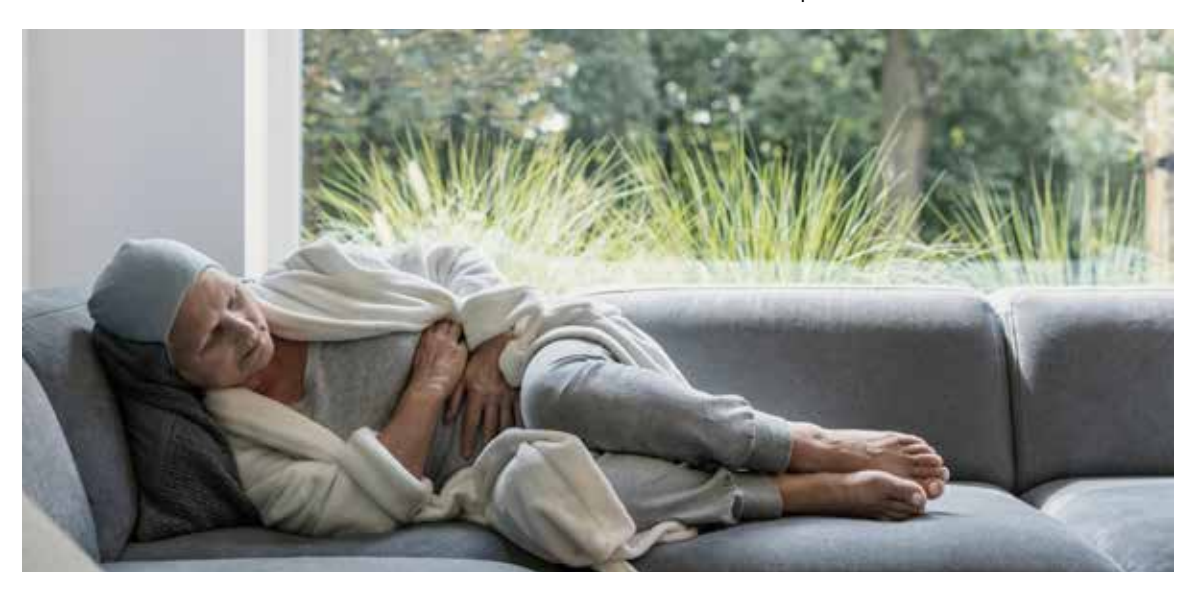
Physical and emotional pain both contribute to the opioid crisis.

HEAL research provides hope for the millions of Americans across the country who need help now.