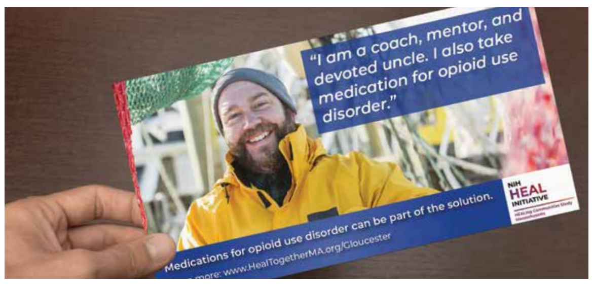
HEAL researchers and community partners developed tailored communication materials like this postcard to promote awareness and use of "Provider on the Pier," a basic medical clinic specializing in addiction treatment in an underserved Massachusetts fishing community at high risk for overdose.