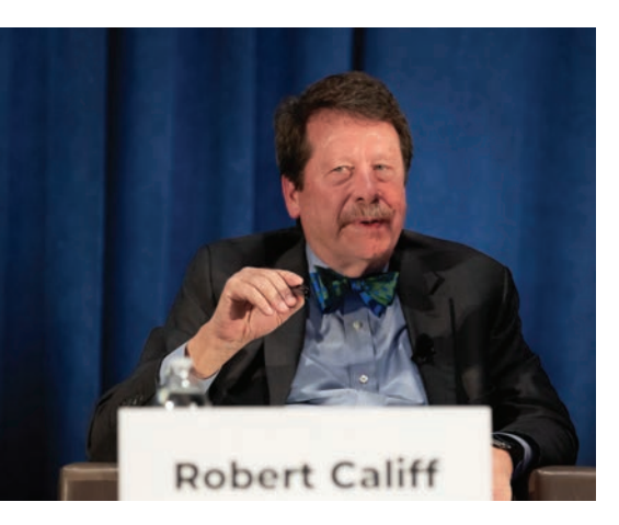
Dr. Robert Califf, Commissioner, U.S. Food and Drug Administration

available scientific evidence and then approves or rejects novel treatments based on this evidence. A broad array of evidence is needed, including not only for innovative treatments but also regarding outcomes for individuals who take opioid medications long-term. FDA recognizes that abstinence from drugs may not be the only relevant outcome when looking at new treatment approaches. Reduced drug use or fewer symptoms can also indicate a substantial benefit for patients, as can other outcomes that are