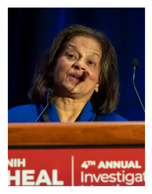
Dr. Rena D'Souza Director of the National Institute of Dental and Craniofacial Research

D'Souza pointed to several HEAL programs that are implementing integrated approaches that can expand the breadth of research and discovery. For example, assessing the effects on infants of opioid exposure during pregnancy can intersect with studies looking at various harmful pre-birth exposures to effects on tooth development. She also pointed to additional examples of holistic research: the HEAL-funded Back Pain Consortium (BACPAC) research program and the new Restoring