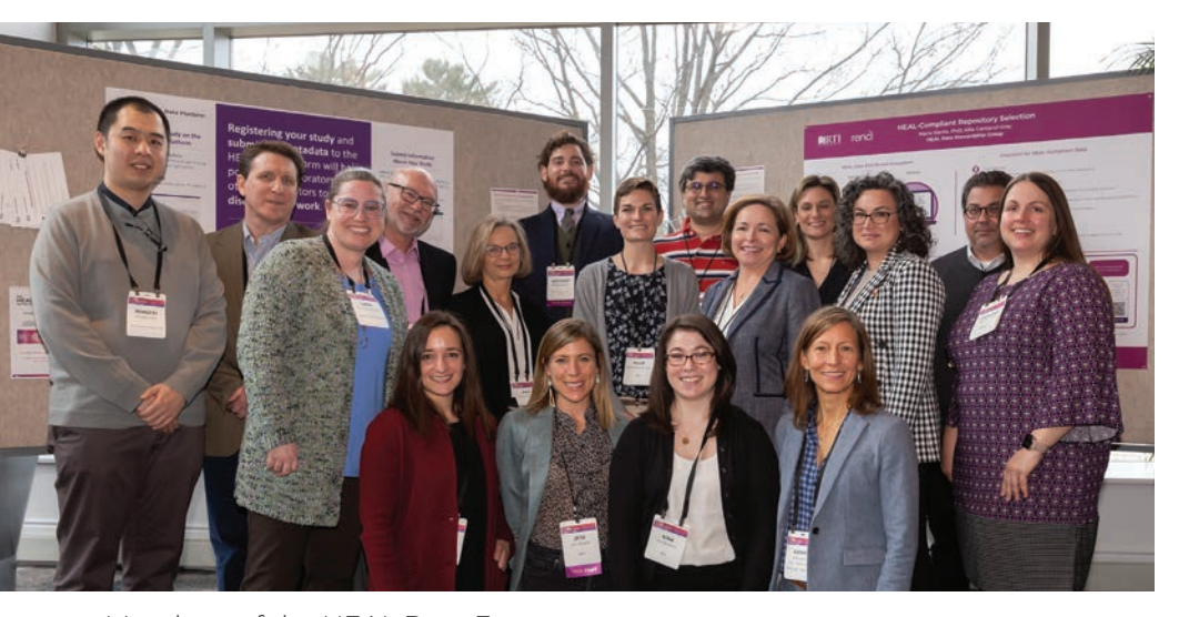
Members of the HEAL Data Ecosystem team

The HEAL Platform is at the heart of its data ecosystem and allows discovery and analysis of Well-annotated, ready-to-use datasets across multiple data repositories.